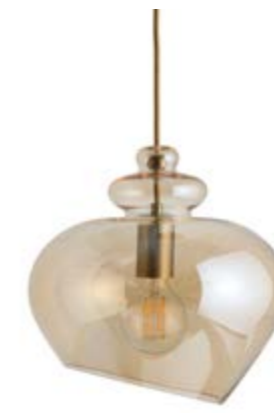
ø21 cm: champagne / antique: with champagne fabric cord brass socket: art.no. 118489