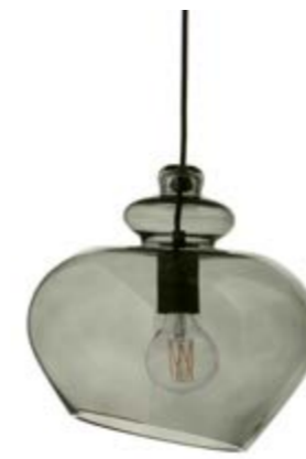
ø21 cm: green / black socket: with black fabric cord art.no. 100238