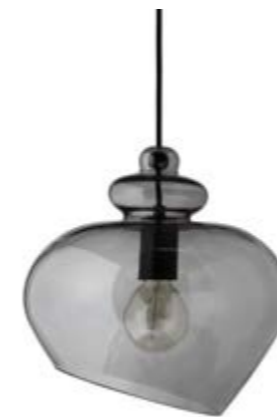
ø21 cm: smoke / black socket: with black fabric cord art.no. 100235