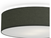
741 Green wool