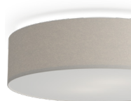
745 White wool