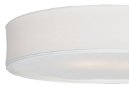
252 White linen