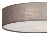
250 Gray linen