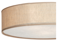
248 Nature linen