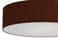
740 Rust wool